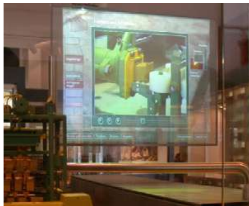
Hologlass / plexi