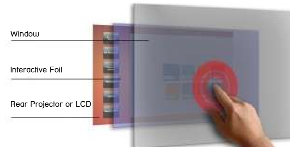
Technical Scheme of Interactive Foil